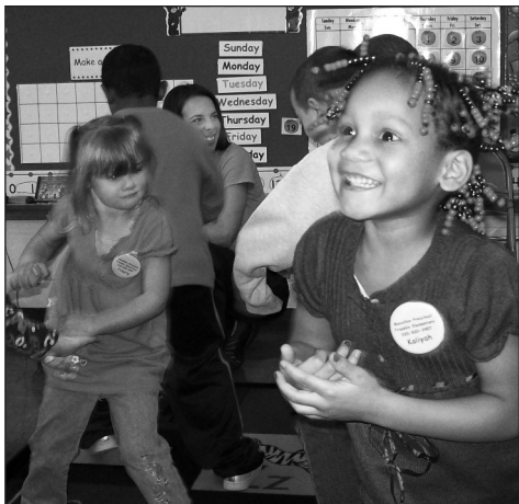
TOP: Children learn by participating in activities provided by each of the collaborators. Representatives from the Canton Symphony Orchestra encourage the preschoolers to try to play their instruments.

ABOVE: Dance and creative movement activities, led by representatives of The Ananda Center for the Arts, help reinforce the lessons of the day.